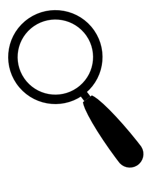
Image: magnifying glass icon

The Language Access Team can review programming, curriculum, and other content and provide recommendations as needed. Content reviews are intended to identify factors that may inhibit cultural relevancy and accuracy for the content's intended audience.