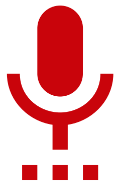
Image: microphone icon

Translations and interpretation are just some ways to provide access. The Language Access coordinates voiceover recordings for videos or content that are intended for more permanent uses.