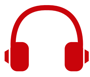
Image: headphone icon

The Language Access Team coordinates interpretation services for colleagues around the state through in-person simultaneous interpretation and consecutive interpreting, online Zoom interpretation, and more. Interpretation services help expand access to Extension programming by accommodating the needs of participants who are dominant in a language other than English.