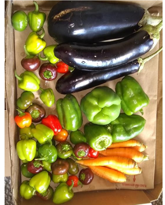
Plymouth Congregational Church