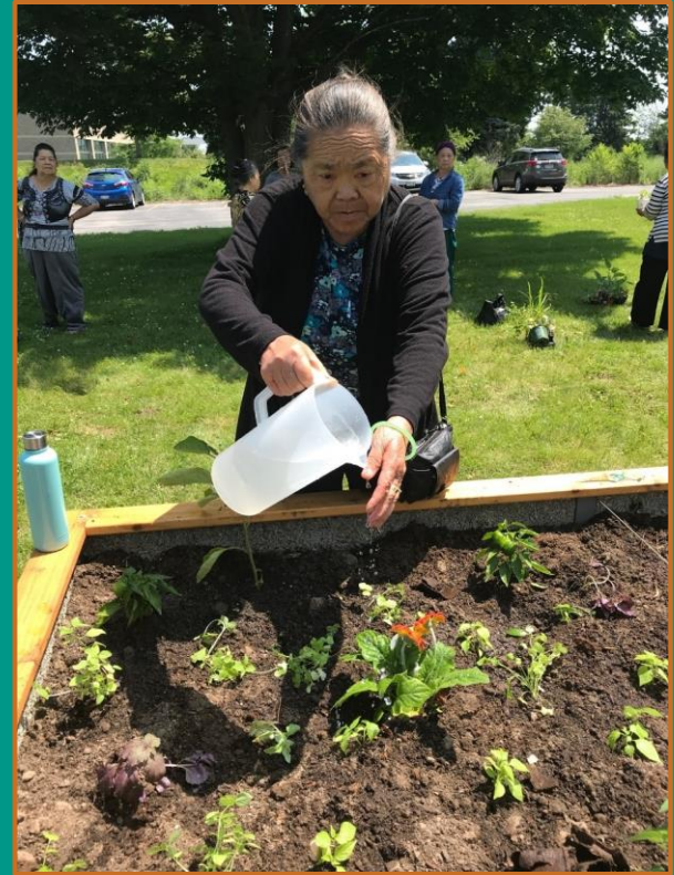
Manitowoc Hmong Elders Garden