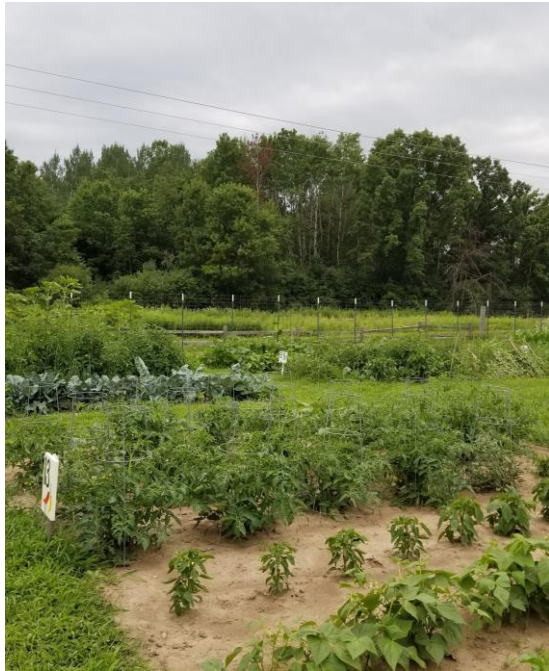
Barron Community Garden