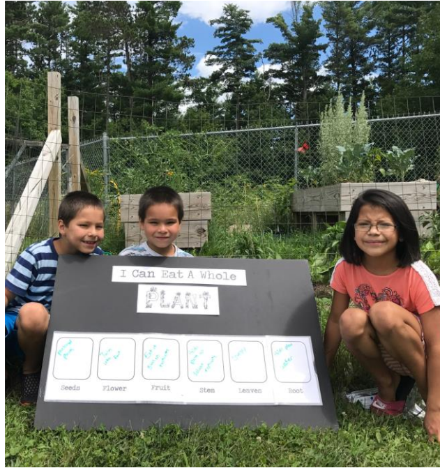
Lac du Flambeau Youth Center