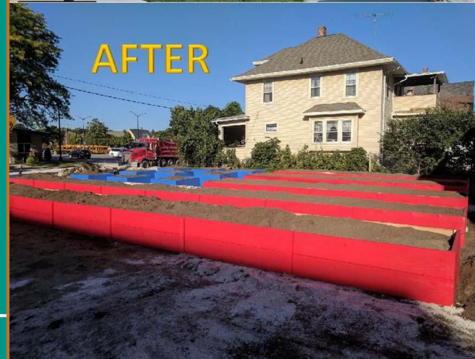
Veterans THRIVE Garden - Fond du Lac