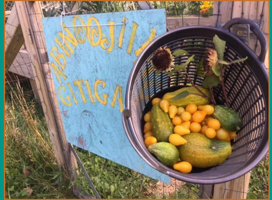
Lac du Flambeau Youth Center Wellness Garden