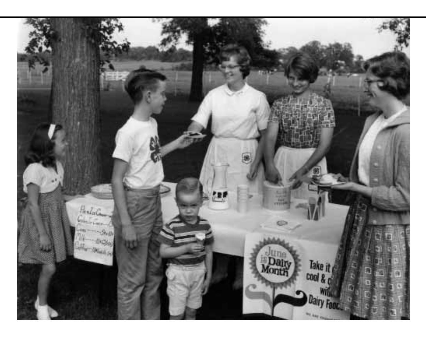
Opposite: The Wisconsin Interstate Championship Team demonstrates dyeing clothes at the Interstate Fair in Sioux City, IA. 1919. Above: The Clever Clovers 4-H Club in Jefferson County hosts an ice cream social to celebrate June Dairy Month in 1964.