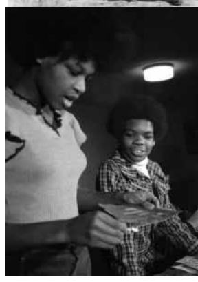
Above: The historical marker declaring the Linn 4-H Club the first club in Wisconsin is unveiled in Lake Geneva, 1970. Below: Whether working with permanent or digital media, 4-H Arts & Communications projects have provided 4-H'ers with a path for exploration and expression.

girls were members of Wisconsin 4-H clubs and enrolled in corn, potato and alfalfa projects. In the early 1920s, Bewick emphasized achievement in these newly formed clubs by providing a 4-H enrollment pin for new members and a second pin to those who finished their projects and submitted a record book. Bewick eventually served on a national committee that selected the 4-H Clover, still used today, as the National 4-H emblem.