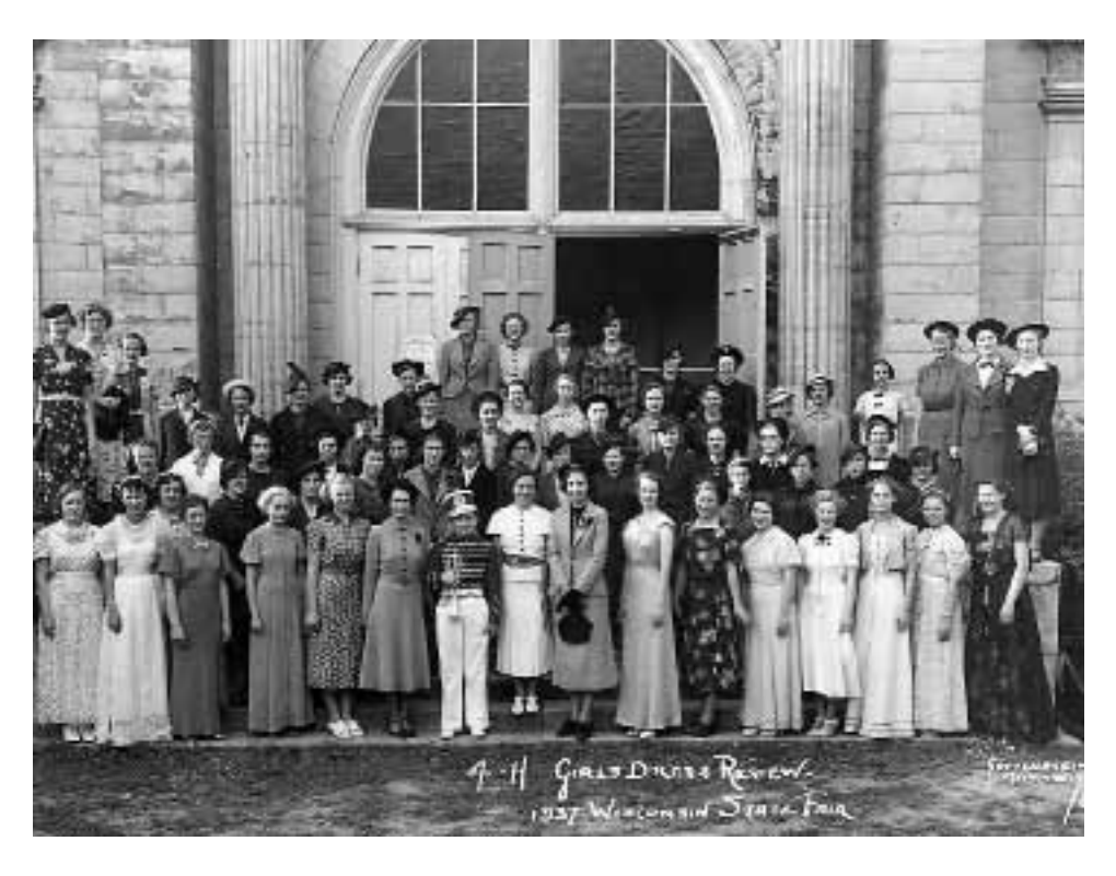
At the 1937 Wisconsin State Fair, a group of girls who are 4-H members pose in the clothes they made as part of their club activities. 1937.